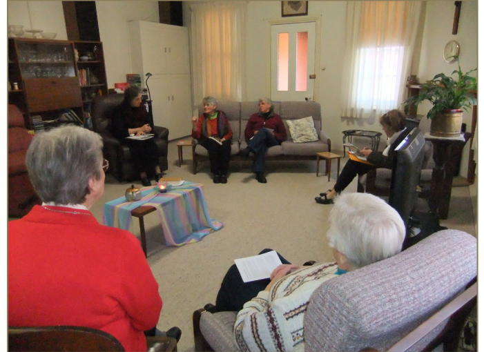
"The Assumption Conversation"